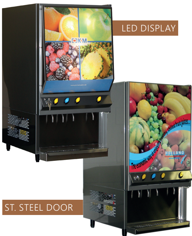
3 JUICE LINES + WATER W445 x D550 x H860 mm