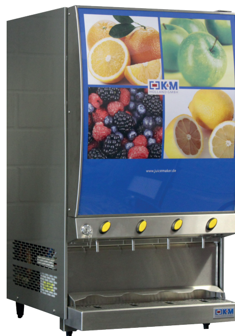
4 JUICE LINES WITOUT WATER LINE