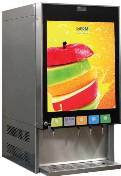
NEW POWER DISPENSER FSD4050

By any avoidance of pumping noises during the tapping procedure, the feeling is always received mediated fresh fruit juice too and no postmix-drink. The mixing ratio can be perfectly adapted by the patented mixing nozzle to the respective need.