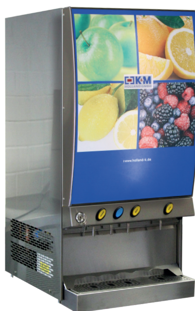
3 JUICE LINES + WATER LINE