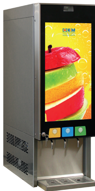
2 JUICE LINES + WATER W320 x D592 x H910 mm