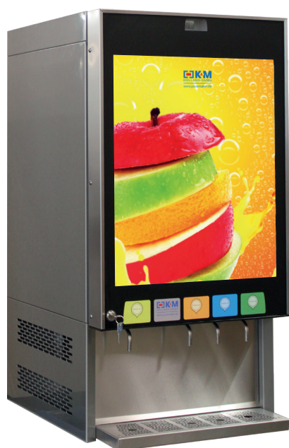
3 JUICE LINES + WATER W460 x D592 x H910 mm