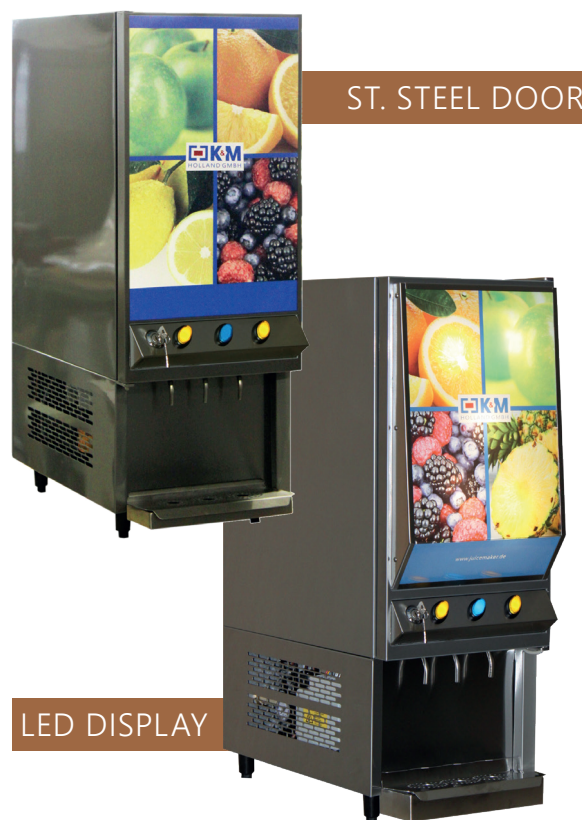
2 JUICE LINES + WATER W320 x D592 x H910 mm