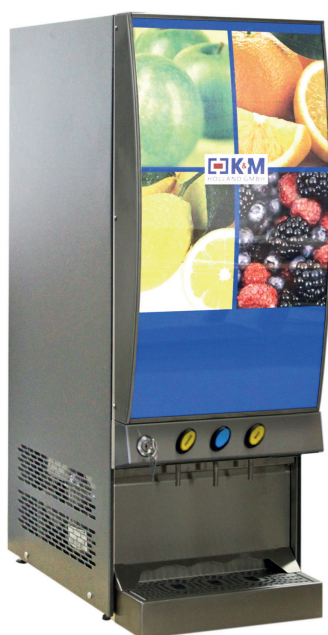
2 JUICE LINES + WATER LINE