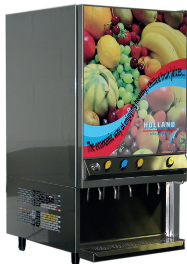
ECO DISPENSER FSD3150